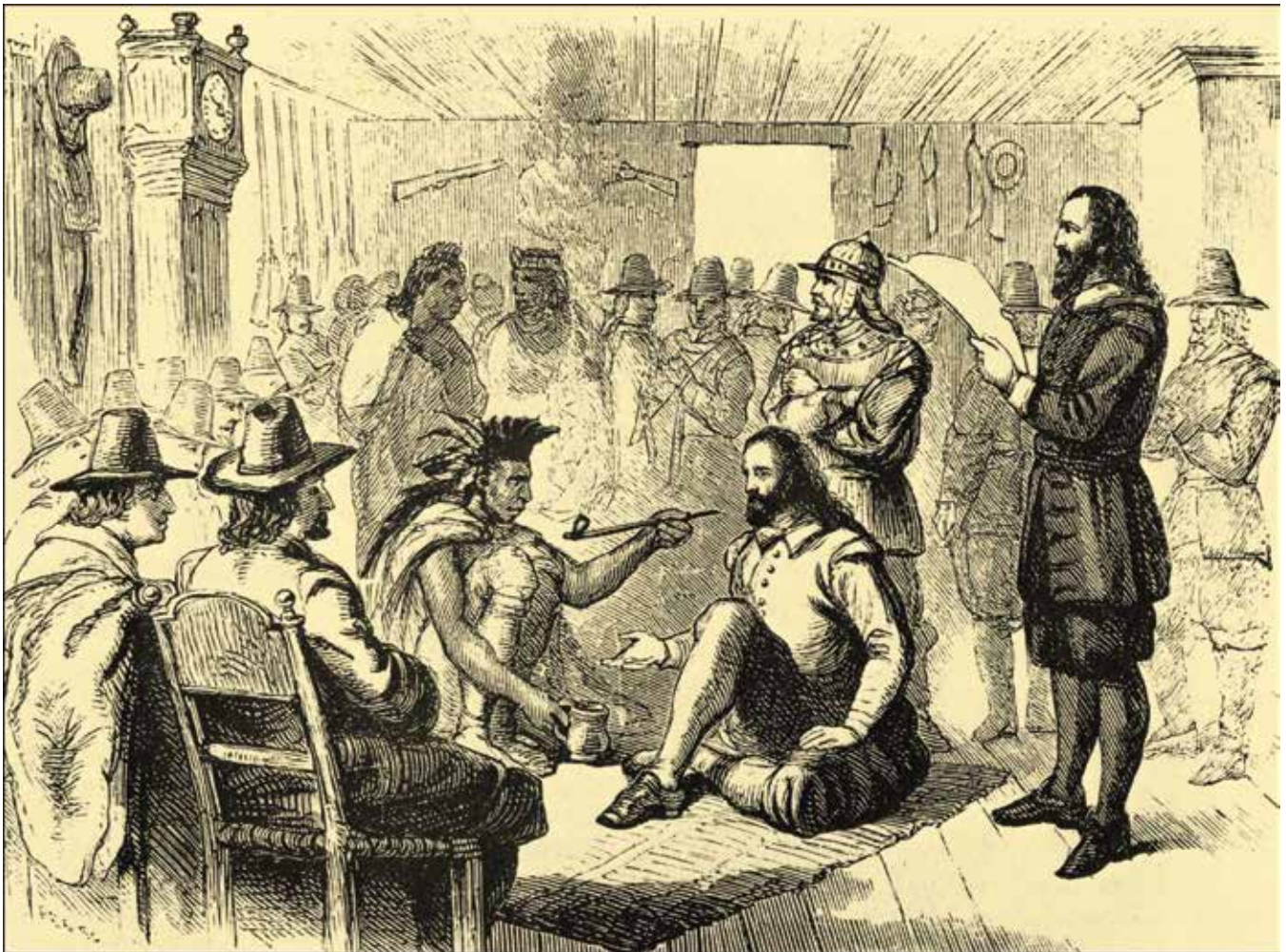
| Pilgrims with Native Americans

Some words in the poem have a number next to them and a definition in the margin. This will help you understand their meanings.